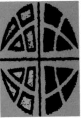
Evangelical Lutheran Church in America

KELC is partnering with Church World Service (CWS), All Africa Conference of Churches (AAC), Anglican Church of Kenya, Fellowship of Council and Churches in Great Lakes area and Horn of Africa (FECIAHA), YWCA-Kenya among other organizations.